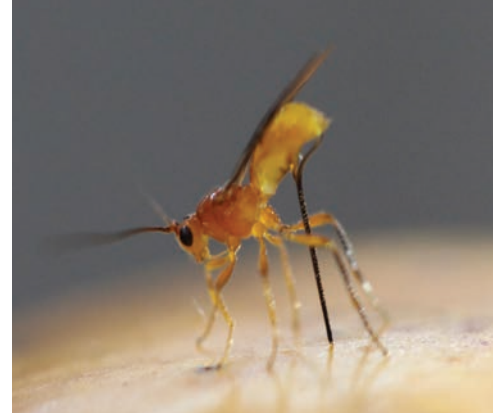
Introduced parasitoid: Diachasmimorpha longicaudata.